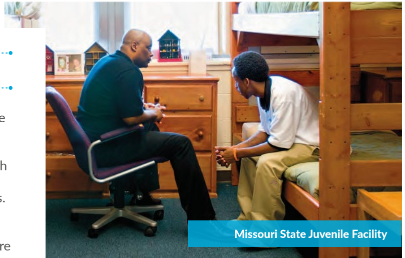
Missouri State Juvenile Facility

"Missouri places youth into closely supervised small groups and applies a rigorous group treatment process offering extensive and ongoing individual attention, rather than isolating confined youth in individual cells or leaving them to fend for themselves among a crowd of delinquent peers." (Mendel, 2010)