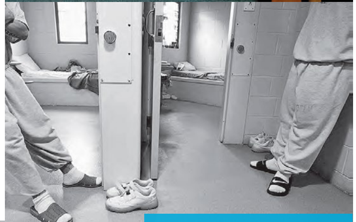
Traditional Youth Correctional Facility