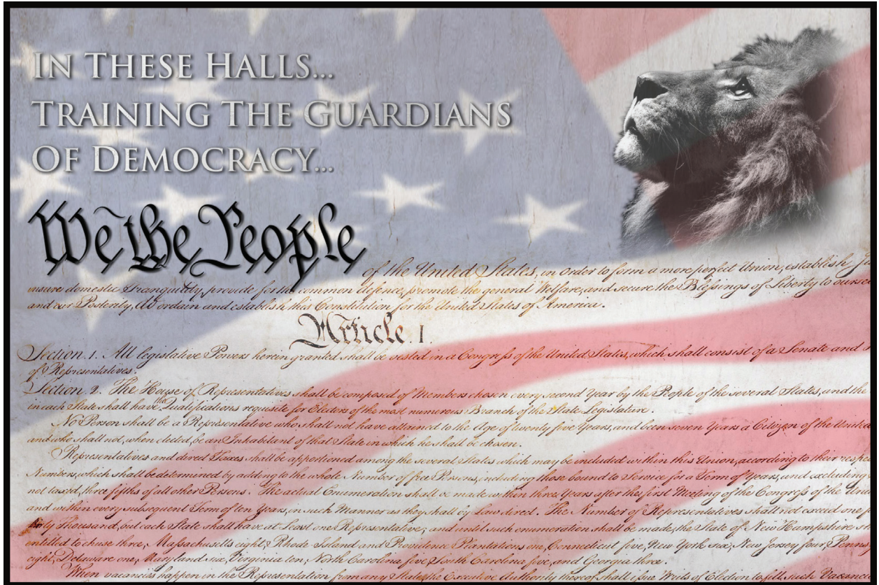
Figure 2. A 6' x 9' Mural of the United States Constitution